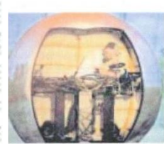
Charisma: DJ Shadow at Brighton's Great Escape

DJ Shadow's attempts to turn what is essentially a DJ set into a major event involves cramming himself into a white globe and projecting films on top of it. His sound – an aural collage of beats and samples – hasn't evolved much in the last 15 years, though he's a keasible host, exuding as much charisma as is possible for a man rapped in a large ping-pong ball.